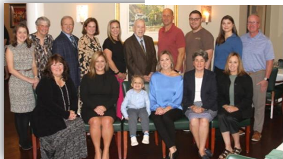
ASSOCIATION OF FUNDRAISING PROFESSIONALS VOLUNTEER OF THE YEAR NATIONAL PHILANTHROPY DAY.